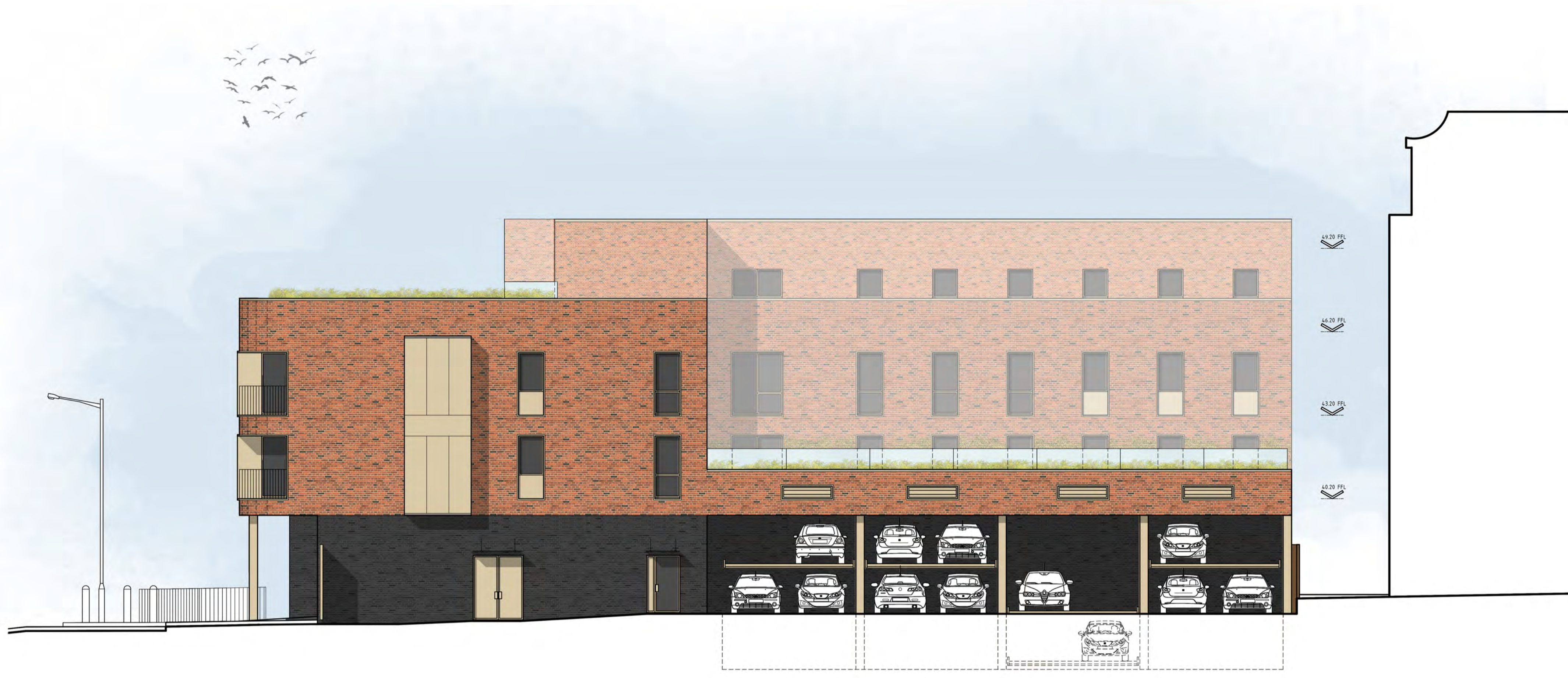
AS PROPOSED: ELEVATION AA (EAST)