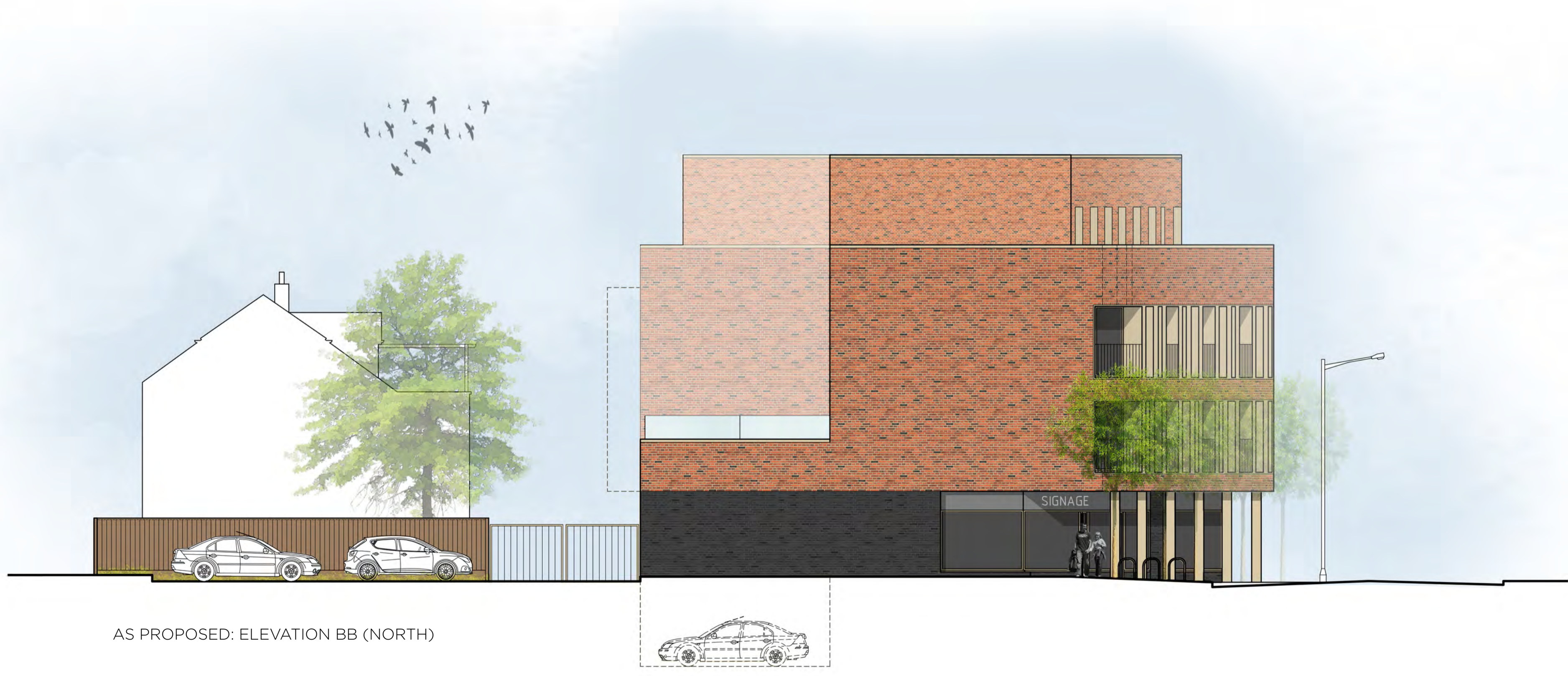
AS PROPOSED: ELEVATION BB (NORTH)